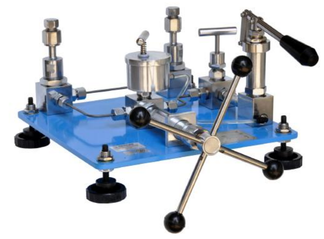
Typical Photo; Final product look may vary