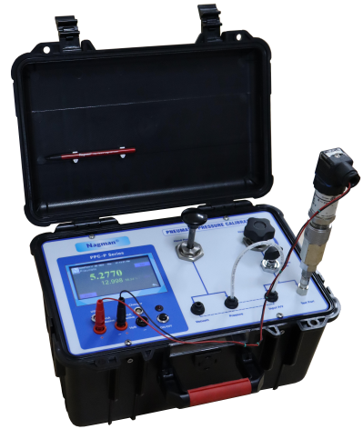
Table-top / Bench-top - Heavy Duty