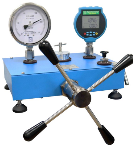
Typical Photo. Final product look may vary. Gauges are not part of standard delivery.